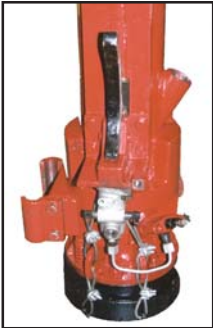
Variable throttle with external pump lever.