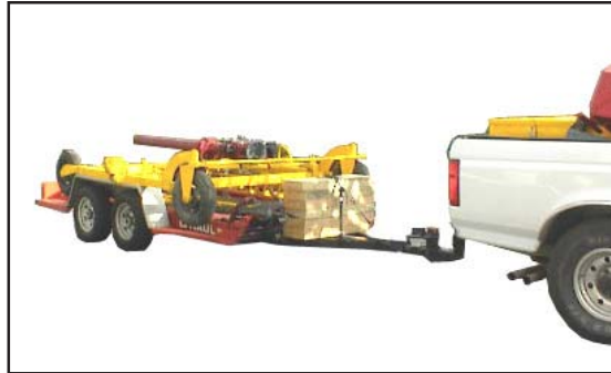
Transportable on small utility trailer.

The APE D1-42 is the smallest diesel hammer in the world. It starts easy and runs clean. It can be attached to an excavator or mounted on an H-Beam leader. APE also provides the D1-42 with a lightweight, front riding leader system complete with side to side adjustment as well as fore and aft batter controls. The leader system can be moved and operated by hand and is transportable using a small pickup trailer. Call your local APE representative for more details.