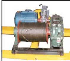
12 volt electric winch.