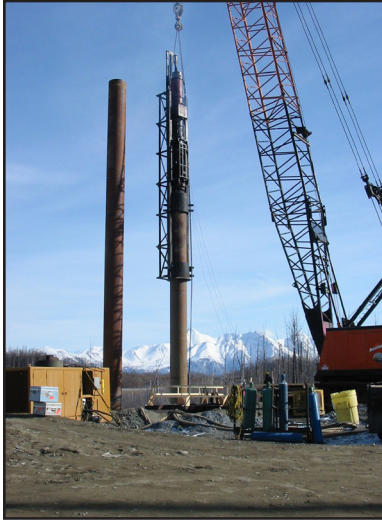
D125-42 in an offshore leader