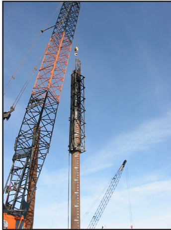
D138-42 in an offshore leader.