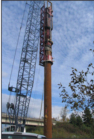
D180-42 driving 48" piles with a 54" offshore.