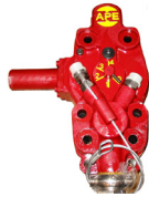
Optional Variable Throttle Control.