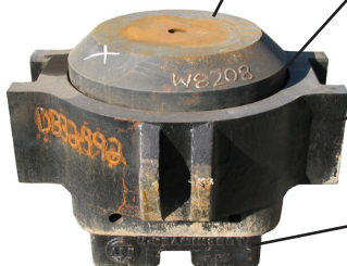
Drive Base Assembly.