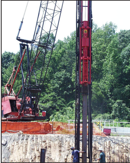
D19-42 driving H-beam.