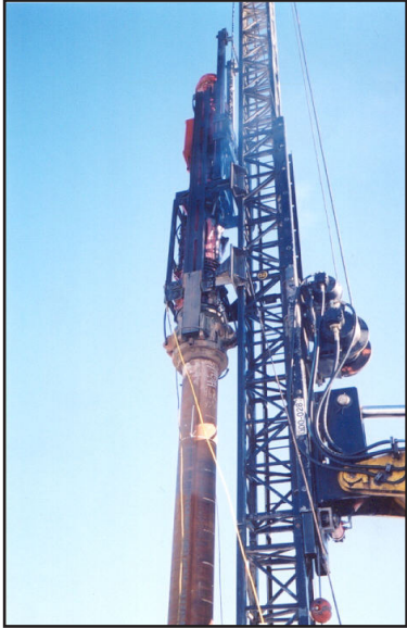
D25-42 with Excavator Mounted Leader.