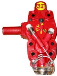
Drive Base Assembly.