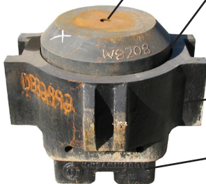
Drive Base Assembly.