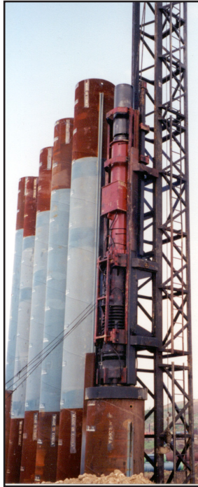
D50-42 in a stand-off.