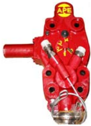
Optional Variable Throttle Control.