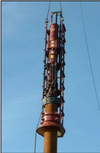
D80-42 in an offshore Leader.