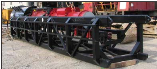
Typical 54" offshore.